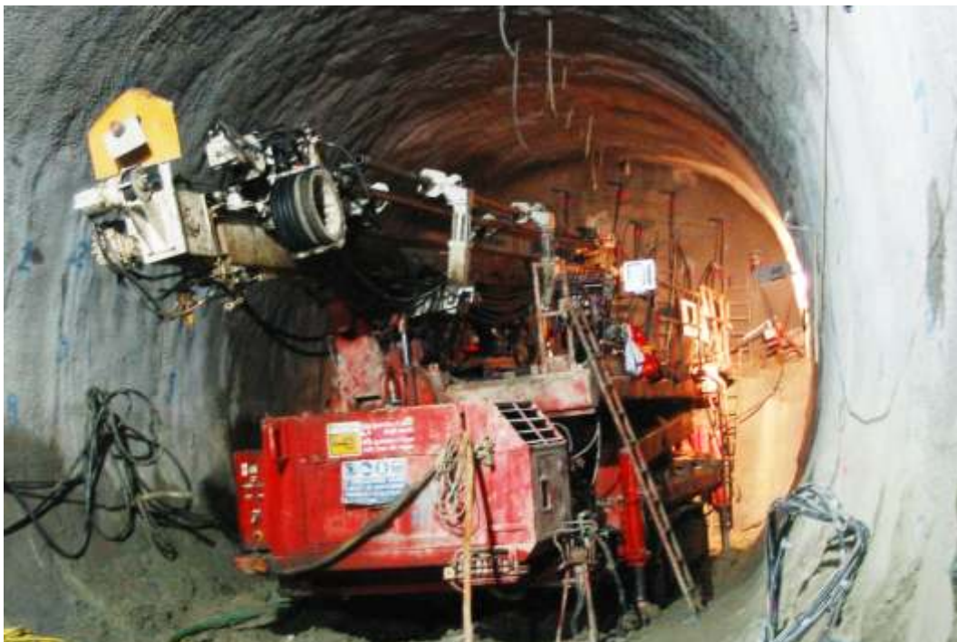
Tunnel drill rig RODIO SR 510 working under compressed air