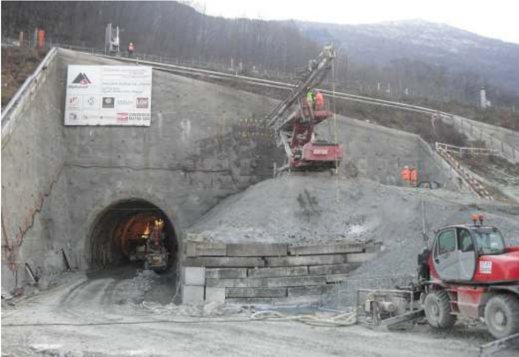
Tunnel drill rig RODIO SR 510 working on the upper crown